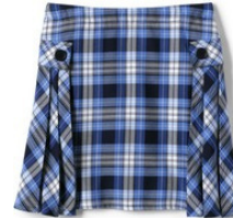
School Uniform Girls Side Pleat Plaid Skort Above the Knee