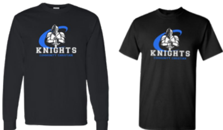
CCS Knights Short or Long Sleeve Spirit shirt Shirts can be ordered from our school store