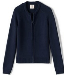
School Uniform Girls Cotton Modal Zip Front Cardigan Sweater