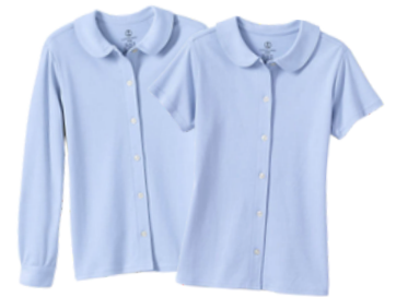
School Uniform Girls Short or Long Sleeve Button Front Peter Pan Collar Knit Shirt