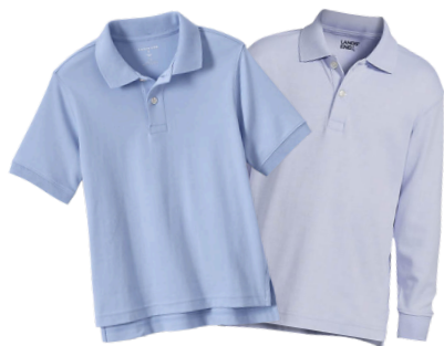
School Uniform Kids Short Sleeve or Long Sleeve Interlock Polo Shirt