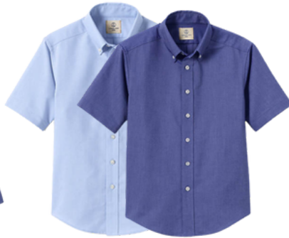
School Uniform Boys Short Sleeve Oxford Dress Shirt