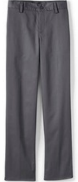
School Uniform Boys Iron Knee Blend Plain Front Chino Pants