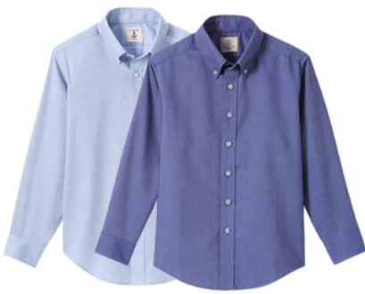
School Uniform Boys Long Sleeve Solid Oxford Dress Shirt