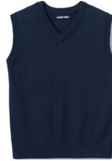
School Uniform Kids Cotton Modal Fine Gauge Sweater Vest