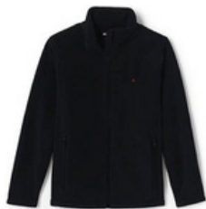
School Uniform Kids Full-Zip Mid-Weight Fleece Jacket