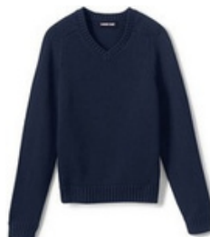
School Uniform Kids Cotton Modal V-neck Sweater