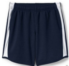
School Uniform Girls Mesh Athletic Gym Shorts