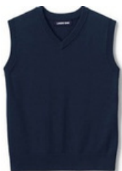
School Uniform Kids Cotton Modal Fine Gauge Sweater Vest