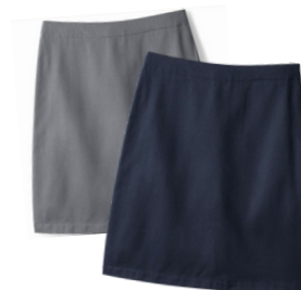
Chino Skort Top of the Knee