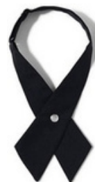
School Uniform Girls Cross Tie (Optional)