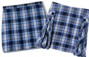
School Uniform Girls Plaid Pleat Skirt or skort