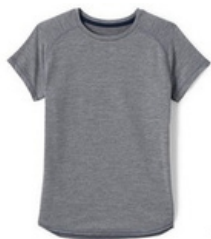
School Uniform Girls Short Sleeve Active Gym T-shirt