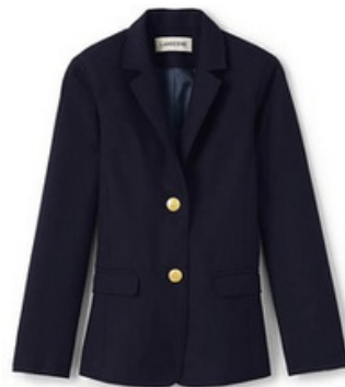
School Uniform Girls Hopsack Blazer