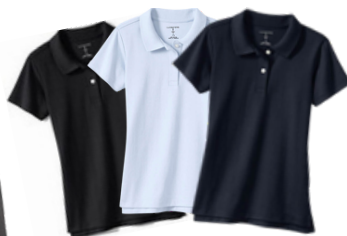
School Uniform Girls Short Sleeve Feminine Fit Interlock Polo Shirt