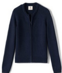
School Uniform Girls Cotton Modal Zip Front Cardigan Sweater