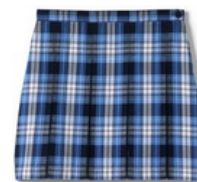
Plaid Box Pleat Skirt - Top of the Knee