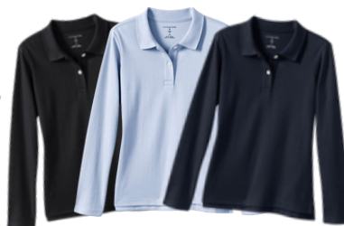
School Uniform Girls Long Sleeve Feminine Fit Interlock Polo Shirt