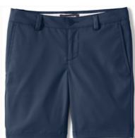
School Uniform Girls Active Chino Shorts