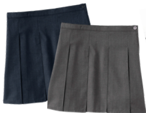
School Uniform Girls Box Pleat Skirt Above The Knee