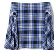
School Uniform Girls Side Pleat Plaid Skort Above the Knee