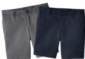
School Uniform Girls Plain Front Blend Chino Shorts