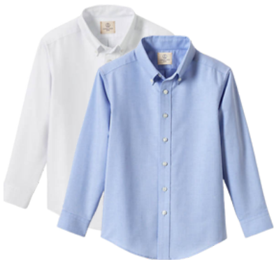
School Uniform Boys Long Sleeve Solid Oxford Dress Shirt