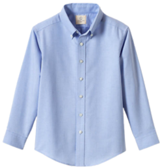
School Uniform Boys Long Sleeve Solid Oxford Dress Shirt- Blue