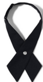
School Uniform Girls Cross Tie (Optional)