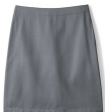
School Uniform Girls Blend Chino Skort Top of Knee Gray or Navy