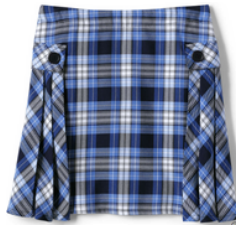
School Uniform Girls Side Pleat Plaid Skirt Above the Knee