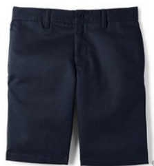
School Uniform Boys Wrinkle Resistant Chino Shorts