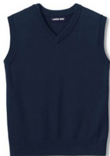
School Uniform Kids Cotton Modal Fine Gauge Sweater Vest