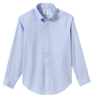
School Uniform Boys Long Sleeve Solid Oxford Dress Shirt