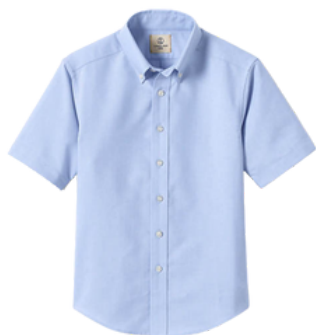
School Uniform Boys Long or Short Sleeve Solid Oxford Dress Shirt