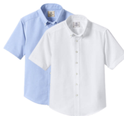
School Uniform Boys Short Sleeve Oxford Dress Shirt