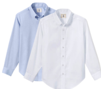
School Uniform Boys Long Sleeve No Iron Pinpoint Dress Shirt