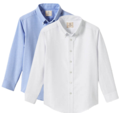
School Uniform Boys Long Sleeve Solid Oxford Dress Shirt