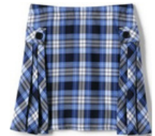
School Uniform Girls Side Pleat Plaid Skort Above the Knee