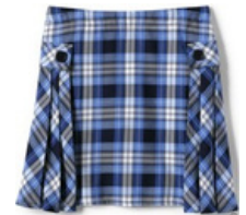
School Uniform Girls Side Pleat Plaid Skort Above the Knee