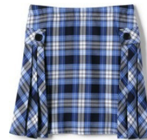
School Uniform Girls Side Pleat Plaid Skort Above the Knee