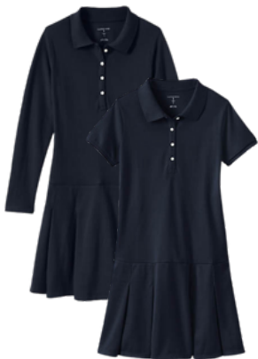
School Uniform Girls Short Sleeve Mesh Polo Dress at the Knee