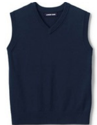
School Uniform Kids Cotton Modal Fine Gauge Sweater Vest