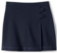
School Uniform Girls Knit Skort Above the Knee