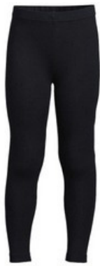
School Uniform Girls Tough Cotton Leggings