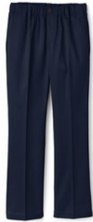
School Uniform Girls Elastic Waist Pull-On Chino Pants (K-1 Grade Only)