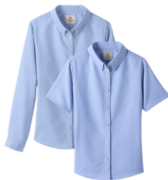
School Uniform Girls Short or Long Sleeve Oxford Dress Shirt