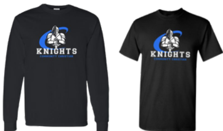
CCS Knights Short or Long Sleeve Spirit shirt