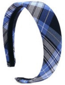
School Uniform Girls Plaid Headband (Optional)