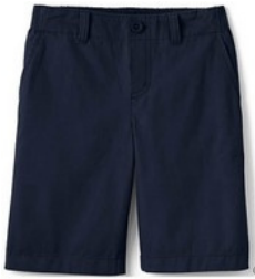
School Uniform Kids Elastic Waist Pull On Shorts (K-1 Grade Only)