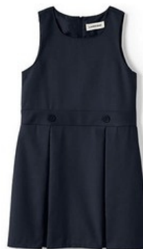
School Uniform Girls Jumper Top of Knee