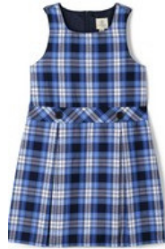
School Uniform Girls Plaid Jumper Top of Knee