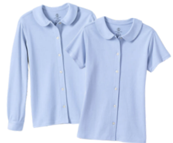
School Uniform Girls Short or Long Sleeve Button Front Peter Pan Collar Knit Shirt