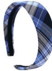
School Uniform Girls Plaid Headband (Optional)