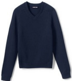
School Uniform Kids Cotton Modal V-neck Sweater