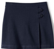
School Uniform Girls Knit Skort Above the Knee