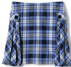
School Uniform Girls Side Pleat Plaid Skirt Above the Knee