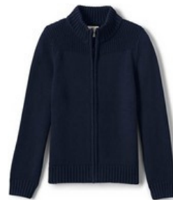
School Uniform Boys Cotton Modal Zip Front Cardigan Sweater