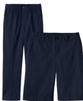
School Uniform Boys Elastic Waist Pull-On Pants or Shorts (K-1 Grade Only)