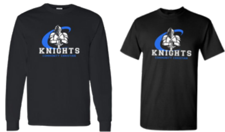
CCS Knights Short or Long Sleeve Spirit shirt