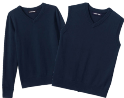
School Uniform Boys Cotton Modal Fine Gauge V-neck Sweater or Vest