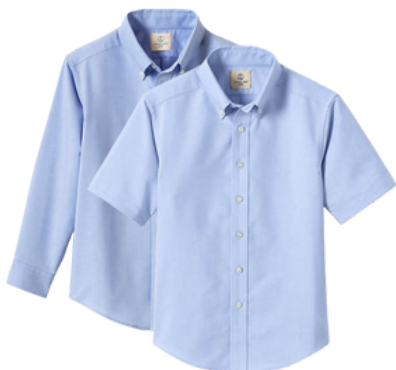
School Uniform Boys Long or Short Sleeve Solid Oxford Dress Shirt