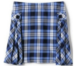
School Uniform Girls Side Pleat Plaid Skort Above the Knee