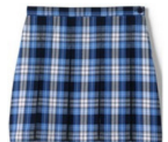
School Uniform Girls Plaid Box Pleat Skirt - Top of the Knee