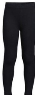
School Uniform Girls Tough Cotton Leggings