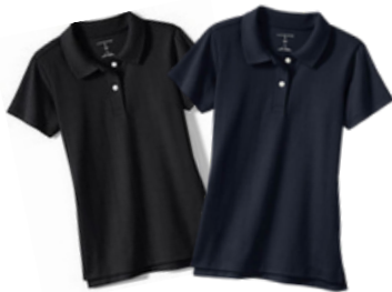
School Uniform Girls Short Sleeve Feminine Fit Interlock Polo Shirt