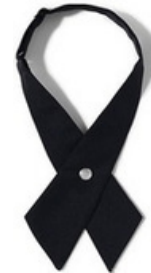
School Uniform Girls Cross Tie (Optional)