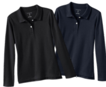
School Uniform Girls Long Sleeve Feminine Fit Interlock Polo Shirt