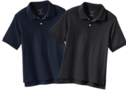
School Uniform Kids Short Sleeve Interlock Polo Shirt