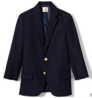
School Uniform Boys Hopsack Blazer