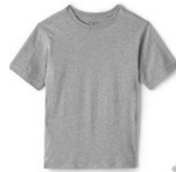
School Uniform Boys Short Sleeve Essential T-shirt