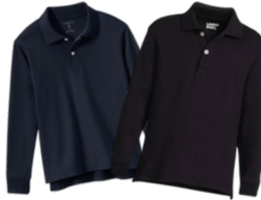
School Uniform Kids Long Sleeve Interlock Polo Shirt