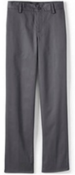
School Uniform Boys Iron Knee Blend Plain Front Chino Pants