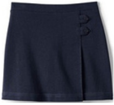
School Uniform Girls Knit Skort Above the Knee