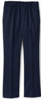
School Uniform Girls Elastic Waist Pull-On Chino Pants (K-1 Grade Only)