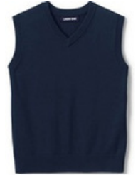
School Uniform Kids Cotton Modal Fine Gauge Sweater Vest