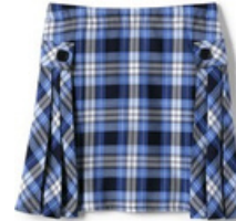
School Uniform Girls Side Pleat Plaid Skort Above the Knee