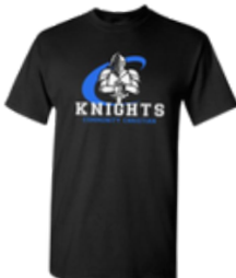
CCS Knights Short or Long Sleeve Spirit shirt