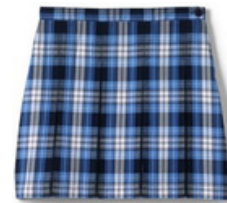
School Uniform Girls Plaid Box Pleat Skirt Top of the Knee