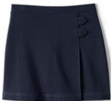
School Uniform Girls Knit Skort Above the Knee