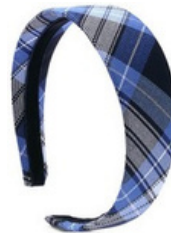
School Uniform Girls Plaid Headband (Optional)