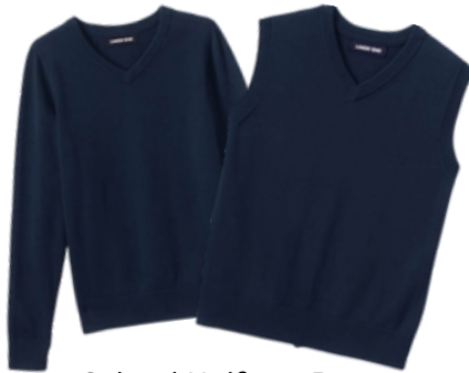
School Uniform Boys Cotton Modal Fine Gauge V-neck Sweater or Vest