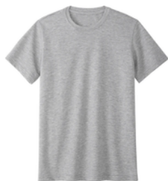
Unisex Crew Tech T-Shirt