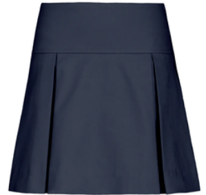
Drop Yoke Pleat Skirt 2 Colors: Grey, Navy