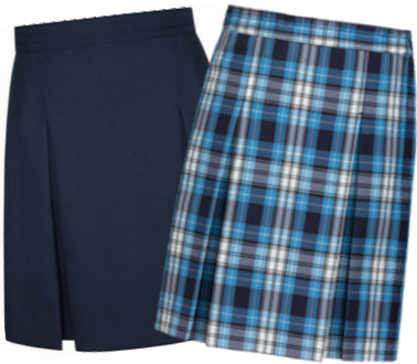
Stitched-Down Kick Pleat Skirt 2 Colors: Navy, Plaid