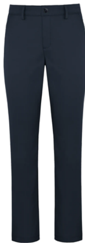
Mid-Rise Stretch Twill Tapered Leg Pants