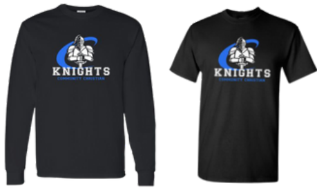
CCS Knights Short or Long Sleeve Spirit shirt Shirts can be ordered from our school store