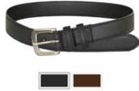
Classic Leather Belt 2 Colors: Black, Brown