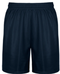
Micro-Mesh Gym Shorts