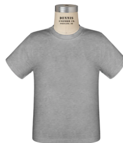
Classic Active T-Shirt