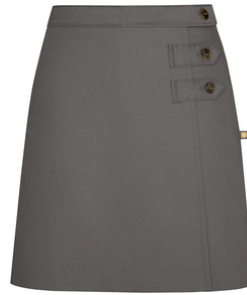
Double Tab Pleat Skirt 2 Colors: Grey, Navy