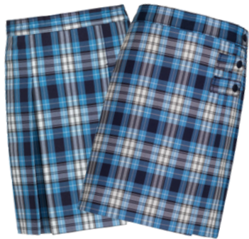
Stitched-Down Kick Pleat Skirt or Plaid Double Tab Pleat Skort