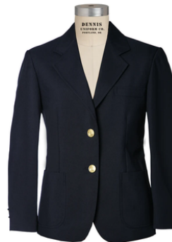
Girls' Gabardine Blazer