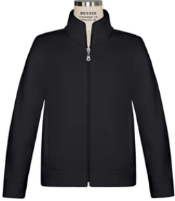
Zip Front Microfleece Jacket with Zip Pockets