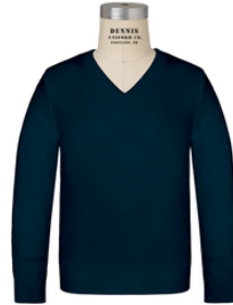
Long Sleeve V-Neck Pullover Sweater