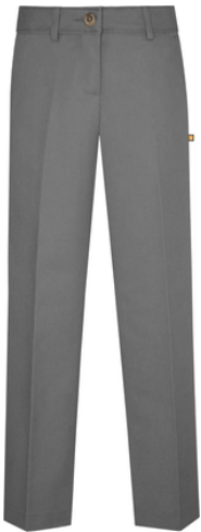
Irvington Stretch Twill Flat Front Pant 2 Colors: Grey, Navy