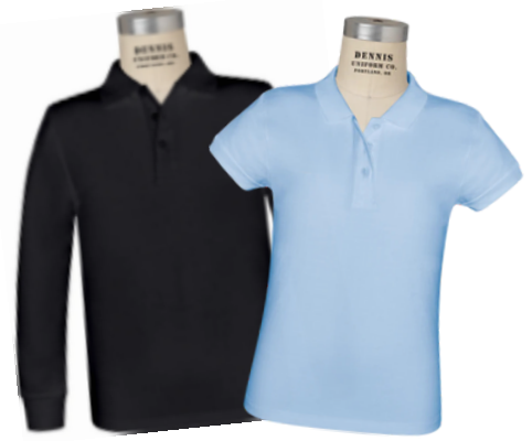
Short or Long Sleeve Jersey Polo 3 Colors: Black, Navy, Light Blue