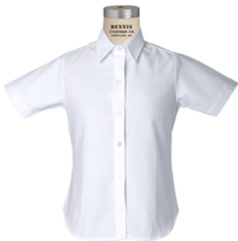
Short or Long Sleeve Feminine Fit Oxford Shirt