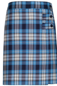
Plaid Double Tab Pleat Skirt