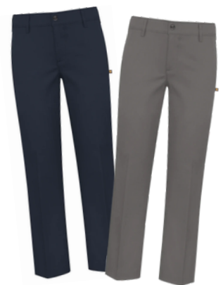
Irvington Flat Front Stretch Dress Pants 2 Colors: Grey, Navy