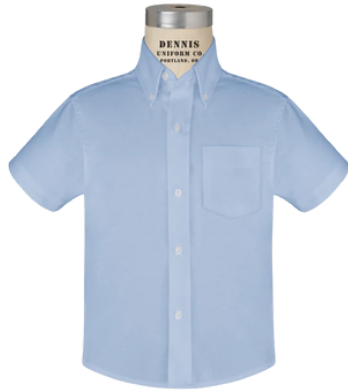
Short Sleeve Oxford Shirt