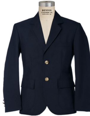
Long Gabardine Blazer