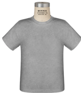
Classic Active T-Shirt