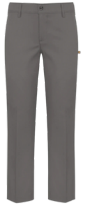
Irvington Flat Front Stretch Dress Pants Grey, Required