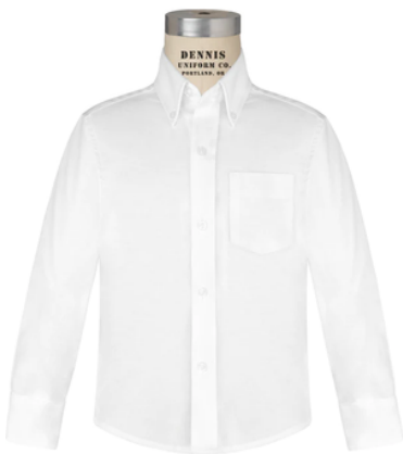
Long Sleeve Oxford Shirt