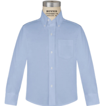
Long Sleeve Oxford Shirt