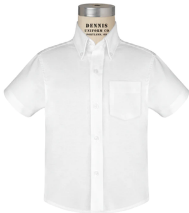
Short Sleeve Oxford Shirt