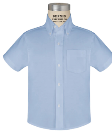
Short Sleeve Oxford Shirt