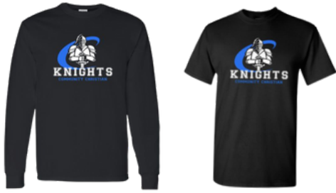
CCS Knights Short or Long Sleeve Spirit shirt