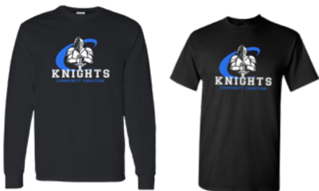
CCS Knights Short or Long Sleeve Spirit shirt