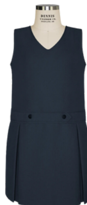
V-Neck Drop Waist Shift