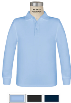
Long Sleeve Jersey Polo 3 Colors: Light Blue, Black, Navy