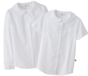
Peter Pan Collar Blouse Long or Short Sleeve