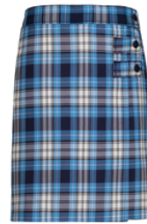
Double Tab Pleat Skort