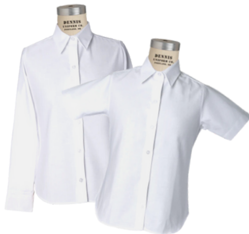
Girls Short or Long Sleeve Feminine Fit Oxford Shirt