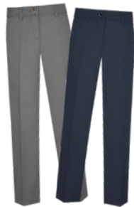
Irvington Stretch Twill Flat Front Pants 2 Colors: Grey, Navy