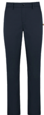
Mid-Rise Stretch Twill Tapered Leg Pants