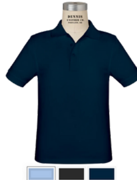
Short Sleeve Jersey Polo 3 Colors: Light Blue, Black, Navy