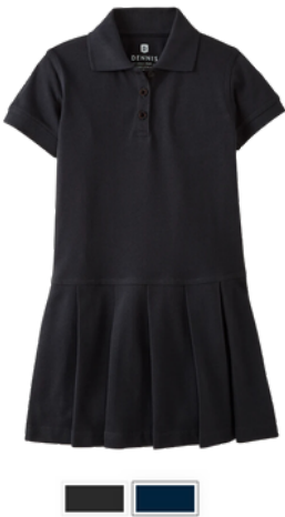
Pleated Piqué Polo Dress 2 Colors: Black, Navy