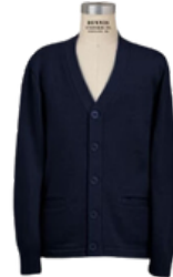
Long Sleeve V-Neck Button Cardigan