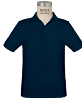
Short Sleeve Jersey Polo 3 Colors: Light Blue, Black, Navy