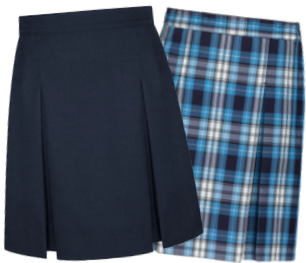
Stitched-Down Kick Pleat Skirt