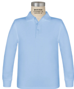
Long Sleeve Jersey Polo 3 Colors: Light Blue, Black, Navy