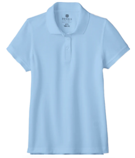
Feminine Fit Short Sleeve Tech Mesh Polo 3 Colors: Light Blue, Black, Navy