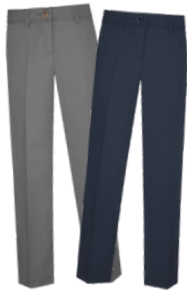
Irvington Stretch Twill Flat Front Pants 2 Colors: Grey, Navy