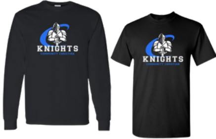
CCS Knights Short or Long Sleeve Spirit shirt