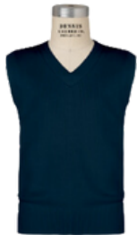
V-Neck Pullover Sweater Vest