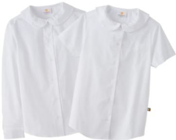
Peter Pan Collar Blouse Long or Short Sleeve