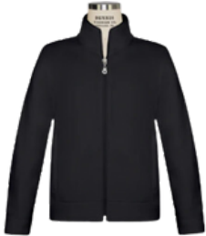
Zip Front Microfleece Jacket with Zip Pockets