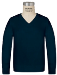
Long Sleeve V-Neck Pullover Sweater