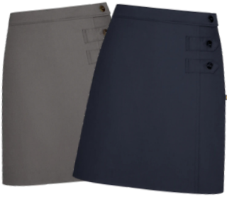
Double Tab Pleat Skort 2 Colors: Grey, Navy