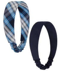
Elastic Back Headband (Optional)