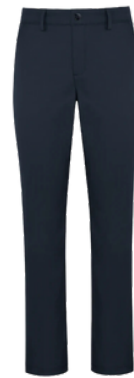
Mid-Rise Stretch Twill Tapered Leg Pants