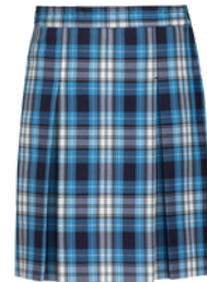
Stitched-Down Kick Pleat Skirt