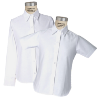
Girls Short or Long Sleeve Feminine Fit Oxford Shirt