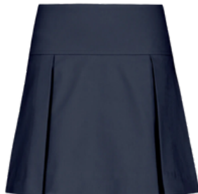
Drop Yoke Pleat Skirt 2 Colors: Grey, Navy