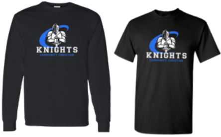
CCS Knights Short or Long Sleeve Spirit shirt