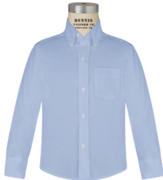
Long Sleeve Oxford Shirt