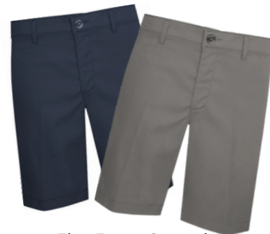
Flat Front Stretch Twill Shorts 2 Colors: Grey, Navy