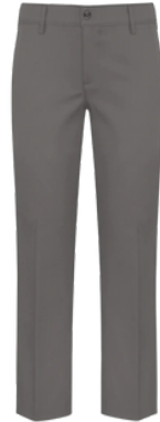
Irvington Flat Front Stretch Dress Pants