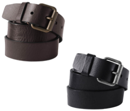
Leather Belt Brown or Black