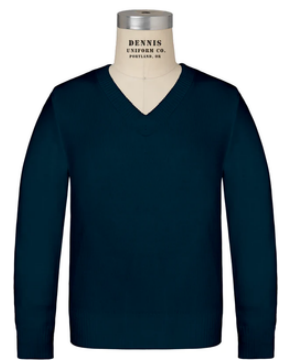
Long Sleeve V-Neck Pullover Sweater