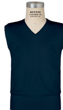
V-Neck Pullover Sweater Vest