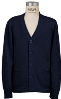
Long Sleeve V-Neck Button Cardigan