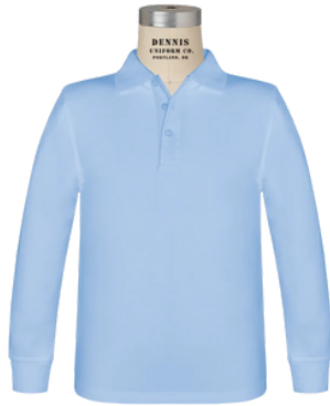
Long Sleeve Jersey Polo