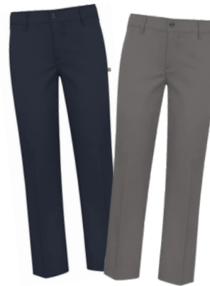
Irvington Flat Front Stretch Dress Pants 2 Colors: Grey, Navy