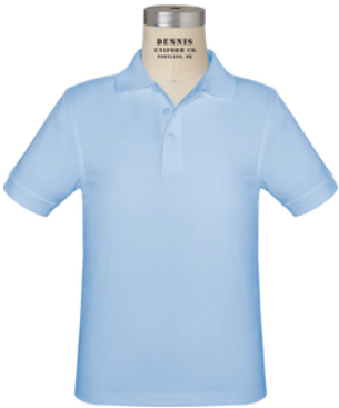
Short Sleeve Jersey Polo