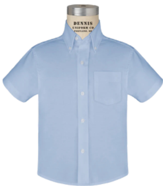
Short Sleeve Oxford Shirt