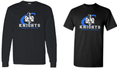
CCS Knights Short or Long Sleeve Spirit shirt