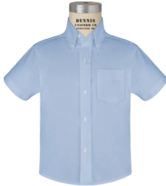
Short Sleeve Oxford Shirt