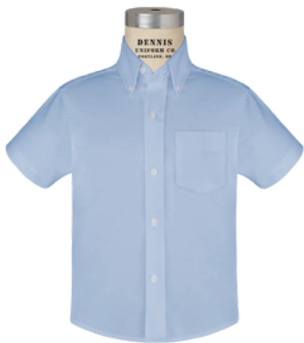
Short Sleeve Oxford Shirt