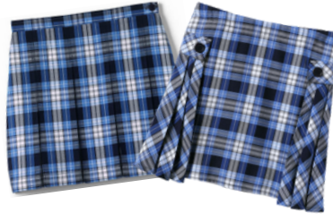
School Uniform Girls Plaid Pleat Skirt or skort