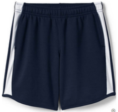
School Uniform Girls Mesh Athletic Gym Shorts