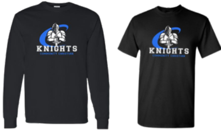
CCS Knights Short or Long Sleeve Spirit shirt Shirts can be ordered from our school store