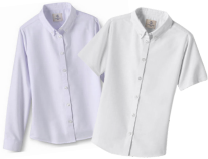
School Uniform Girls Short or Long Sleeve Oxford Dress Shirt