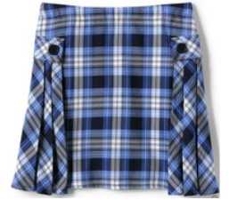
School Uniform Girls Side Pleat Plaid Skort Above the Knee