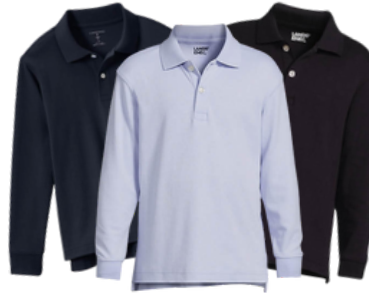
School Uniform Kids Long Sleeve Interlock Polo Shirt