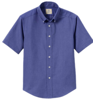
School Uniform Boys Short Sleeve Oxford Dress Shirt