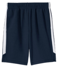
School Uniform Boys Mesh Athletic Gym Shorts