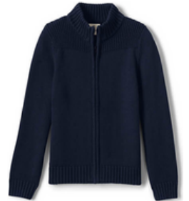
School Uniform Boys Cotton Modal Zip Front Cardigan Sweater