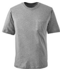
School Uniform Men's Big Short Sleeve Performance Super-T