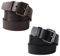
Classic Leather Belt