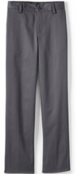
School Uniform Boys Iron Knee Blend Plain Front Chino Pants