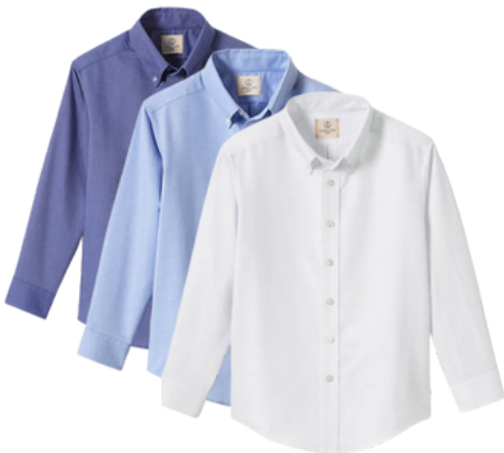
School Uniform Boys Long Sleeve Solid Oxford Dress Shirt