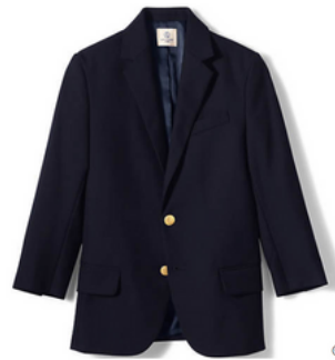
School Uniform Boys Hopsack Blazer