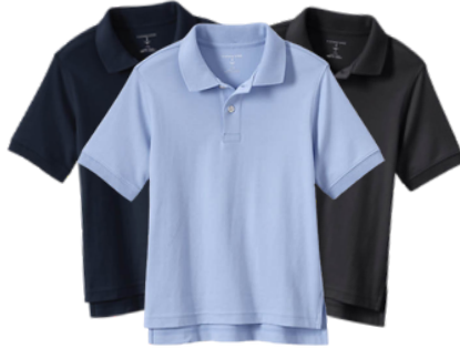
School Uniform Kids Short Sleeve Interlock Polo Shirt