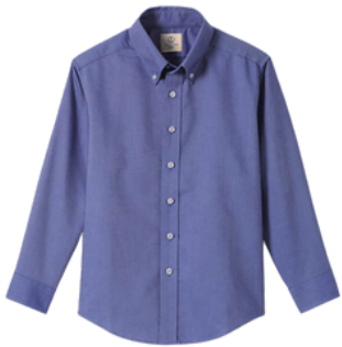
School Uniform Boys Long Sleeve Solid Oxford Dress Shirt