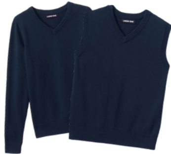
School Uniform Boys Cotton Modal Fine Gauge V-neck Sweater