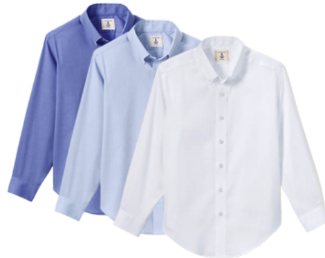
School Uniform Boys Long Sleeve No Iron Pinpoint Dress Shirt