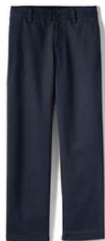
School Uniform Boys Iron Knee Wrinkle Resistant Chino Pants