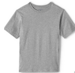
School Uniform Boys Short Sleeve Essential T-shirt