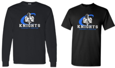
CCS Knights Short or Long Sleeve Spirit shirt