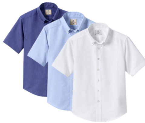
School Uniform Boys Short Sleeve Oxford Dress Shirt