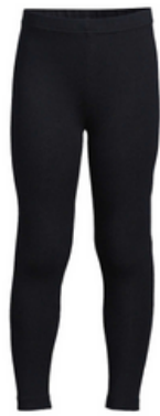
School Uniform Girls Tough Cotton Leggings