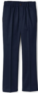
School Uniform Girls Elastic Waist Pull-On Chino Pants (K-1 Grade Only)