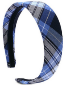
School Uniform Girls Plaid Headband (Optional)