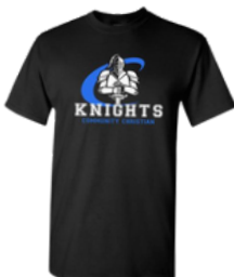
CCS Knights Short or Long Sleeve Spirit shirt