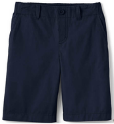
School Uniform Kids Elastic Waist Pull On Shorts (K-1 Grade Only)