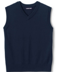
School Uniform Kids Cotton Modal Fine Gauge Sweater Vest