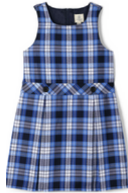
School Uniform Girls Plaid Jumper Top of Knee