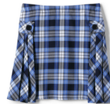
School Uniform Girls Side Pleat Plaid Skort Above the Knee