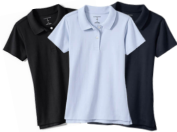
School Uniform Girls Short Sleeve Feminine Fit Interlock Polo Shirt