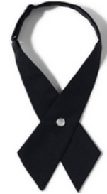
School Uniform Girls Cross Tie (Optional)