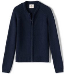
School Uniform Girls Cotton Modal Zip Front Cardigan Sweater