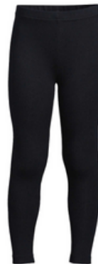
School Uniform Girls Tough Cotton Leggings