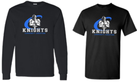
CCS Knights Short or Long Sleeve Spirit shirt