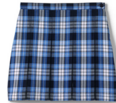
School Uniform Girls Plaid Box Pleat Skirt Top of the Knee