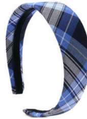
School Uniform Girls Plaid Headband (Optional)