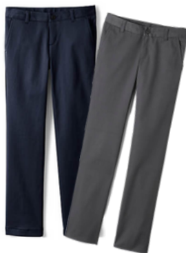
School Uniform Girls Plain Front Stain Resistant Chino Pants