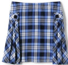
School Uniform Girls Side Pleat Plaid Skirt Above the Knee