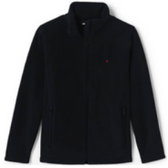
School Uniform Kids Full-Zip Mid-Weight Fleece Jacket