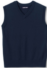
School Uniform Kids Cotton Modal Fine Gauge Sweater Vest