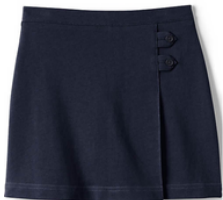
School Uniform Girls Knit Skort Above the Knee