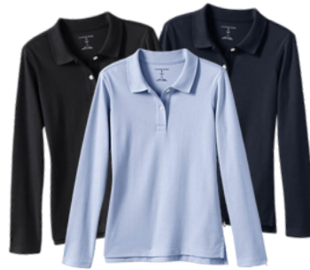
School Uniform Girls Long Sleeve Feminine Fit Interlock Polo Shirt