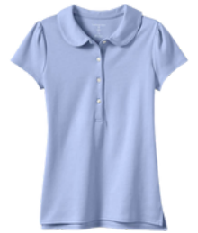
School Uniform Girls Short Sleeve Peter Pan Collar Polo Shirt