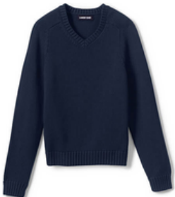
School Uniform Kids Cotton Modal V-neck Sweater