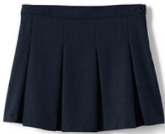
School Uniform Girls Box Pleat Skirt Above The Knee