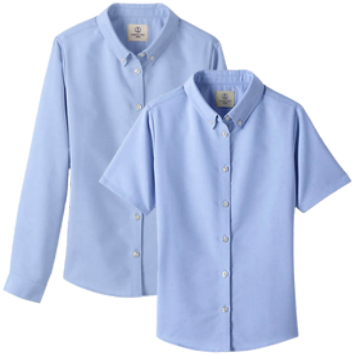
School Uniform Girls Short or Long Sleeve Oxford Dress Shirt