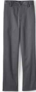
School Uniform Boys Iron Knee Blend Plain Front Chino Pants