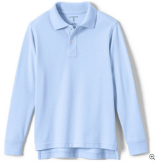
School Uniform Kids Long Sleeve Mesh Polo Shirt