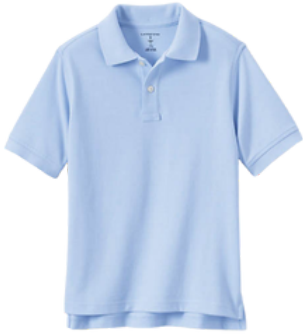
School Uniform Kids Short Sleeve Mesh Polo Shirt