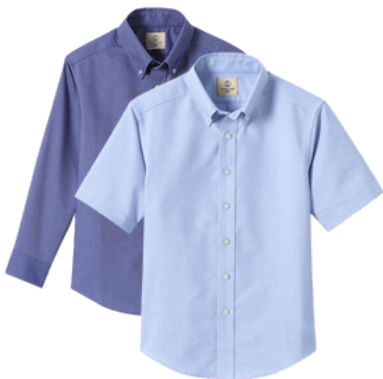
School Uniform Boys Long or Short Sleeve Solid Oxford Dress Shirt