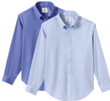
School Uniform Boys Long Sleeve No Iron Pinpoint Dress Shirt