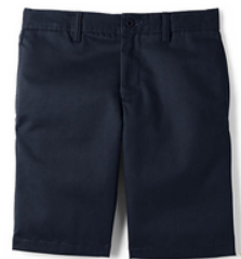
School Uniform Boys Wrinkle Resistant Chino Shorts