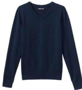
School Uniform Boys Cotton Modal Fine Gauge V-neck Sweater