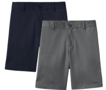
School Uniform Boys Plain Front Blend Chino Shorts